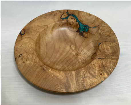
Bob McClintick had a burl and figured elm platter with turquoise epoxy to fill voids