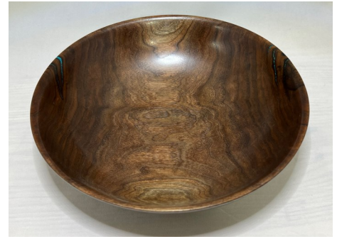
Another bowl by Bob, walnut bowl with turquoise epoxy accents