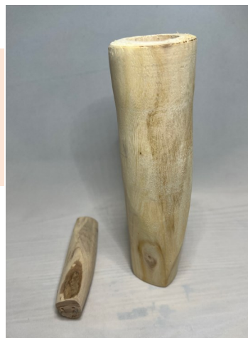
Dale Field had two multi-axis turnings