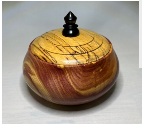
Jim Brodd shared an aromatic cedar vessel with a spalted maple lid and a blackwood finial