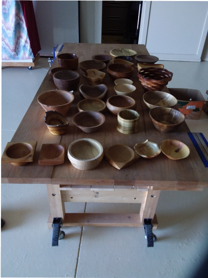
Table for Empty bowls