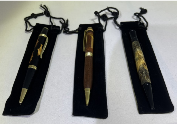
LeAnn Kemper Turned these pens. One is a buckeye burl, another is a Rockler fish inlay and the other is walnut with a segmented upper part.