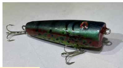
Art Buhs turned these fishing lures. He air brushed the colors.