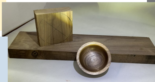
Guy Schafer turned this candle holder from some apple. The small bowl was turned from some dimensional walnut he purchased from Renneberg Hardwoods in St Cloud.