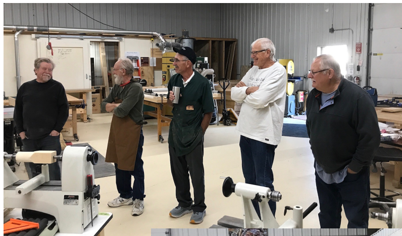
The crew at work!