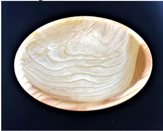
Guy Florek's green ash shallow bowl