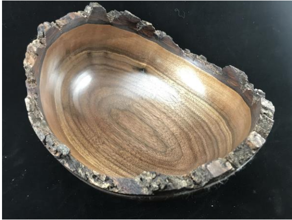
Dan Monson also made this natural edge walnut bowl above and the walnut bowl below.