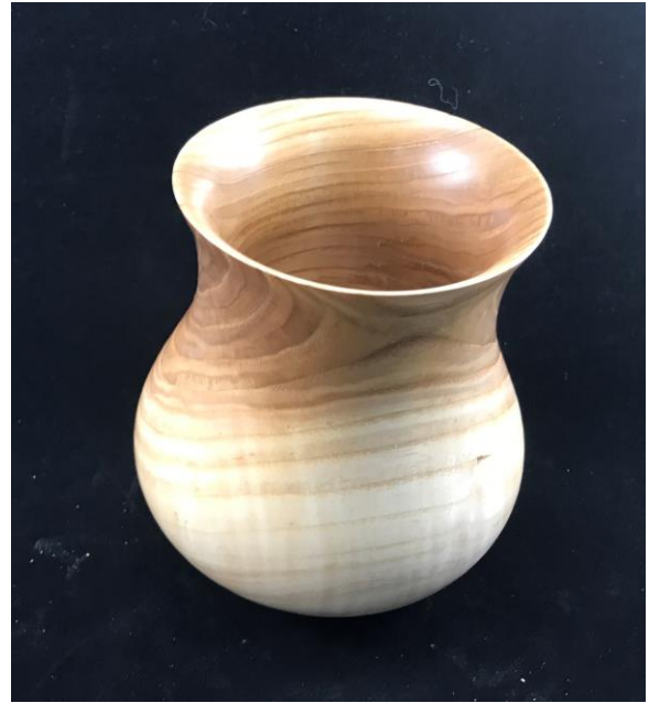
Guy Florek's green ash hollow vessel