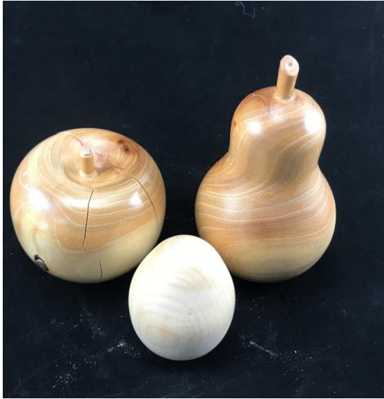
Art Buhs green buckthorn fruit