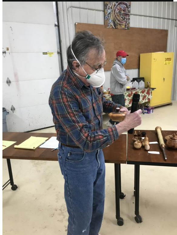
Bill Langen's segmented vessel with walnut and stone pull lid