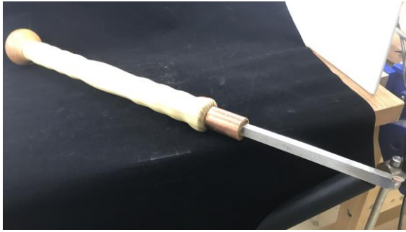
Art Buhs homemade carbide tool and handle