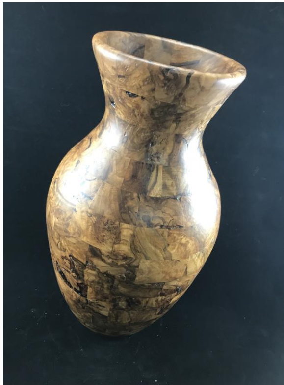
Gary Mrozek made this segmented vessel from maple burl wood he cut into lumber and dried