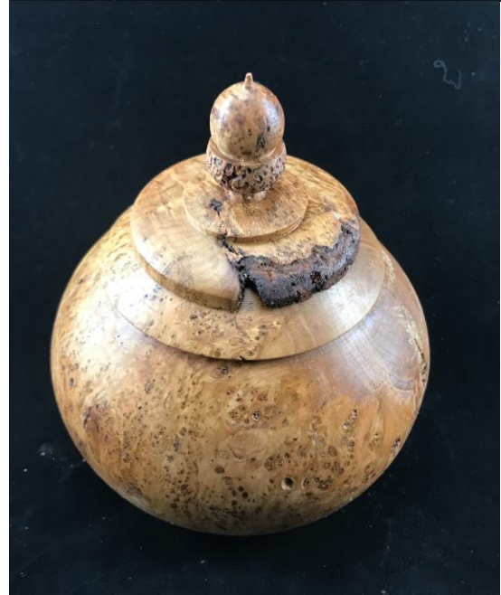
Jim Preusser made these 3 lidded vessels