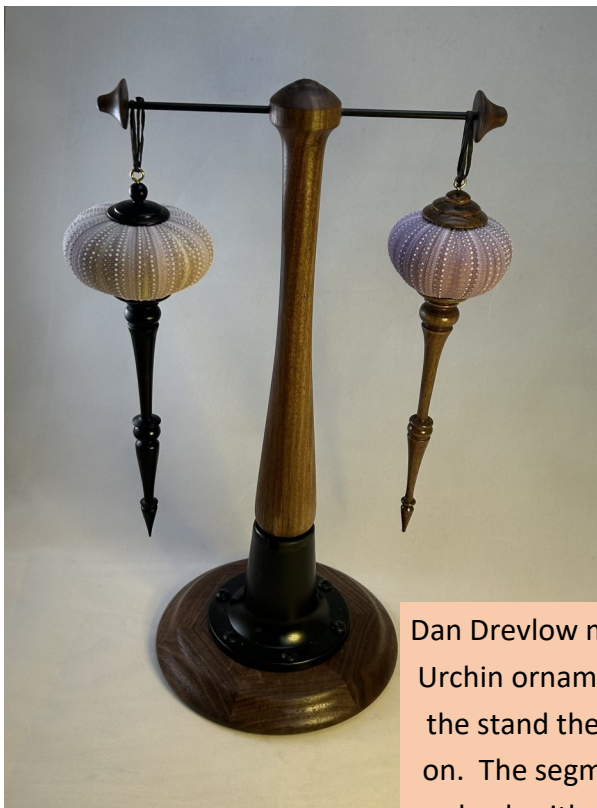
Dan Drevlow made these Sea Urchin ornaments as well as the stand they are hanging on. The segmented bowl is red oak with walnut veneer and walnut and the bowl is wood rescued from a brush pile at the compost site with resin accents