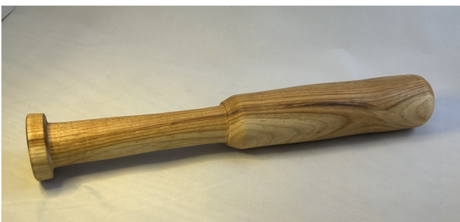
I forgot to write down who made this mallet, it is a nice mallet though