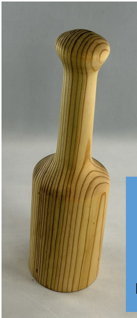
Fred Schmoll's mallet was made from pallet scraps