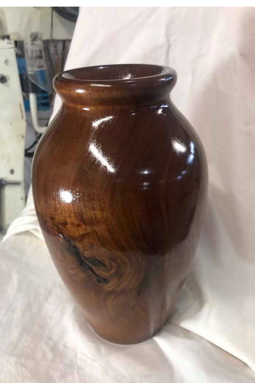
Bill Baker turned this great walnut vase. It is about 9 inches high.