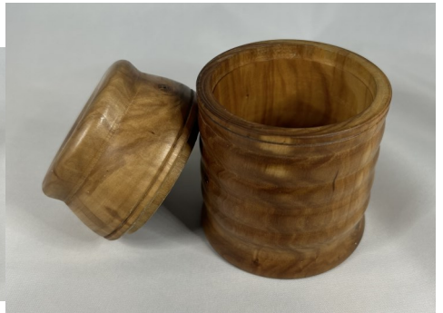
Terry Kreiling made this spiraling bowl from poplar, the lidded box is made from crab apple and the pen with the Celtic knot is oak and walnut. He made the pen box from mahogany.