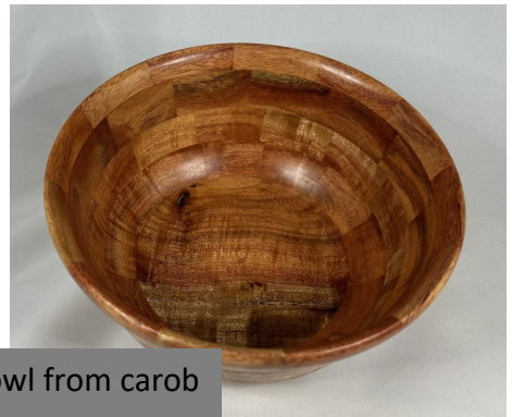
Barb Peterson turned this bowl from carob wood. The pods or seeds from the tree are a modern substitute for chocolate, a great tree!