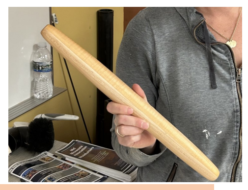
Some examples of some of the "pretty sticks" turned. They have to learn to make those beads and coves first! They evolve from there to other objects as you can see.