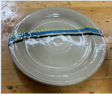
Karen Maier didn't turn this on a lathe but a potter's wheel, it was turned and it is a plate!