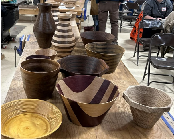
Link to a video about the Ring Master