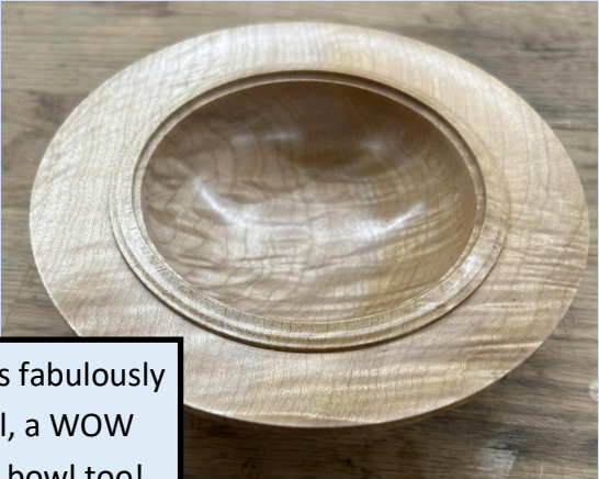
Ellen Starr turned this fabulously figured maple bowl, a WOW piece of wood, nice bowl too!