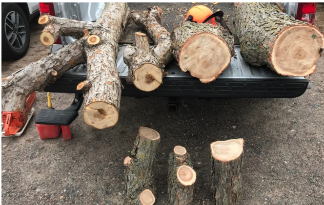
Some of the green apple and Kentucky Coffee Tree wood that was available to members.