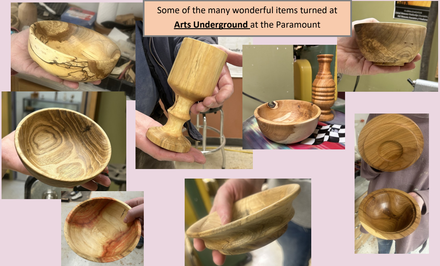
Some of the many wonderful items turned at Arts Underground at the Paramount

Open Shop is the first Thursday and the second Tuesday of every month.