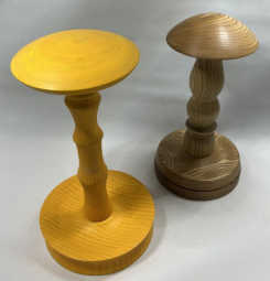
Guy Schafer's wig stands