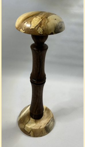
Tyler Smith's wig stand